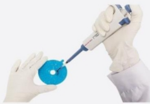
1. Add sample & diluent

From sample to complete results in 3 simple steps in approximately 13 minutes