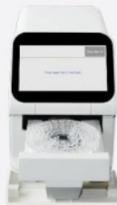
2. Insert disc