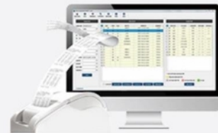
3. Read results